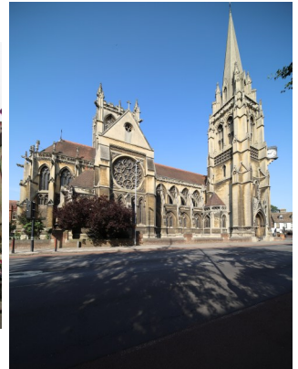
OLEM Church, Hills Road