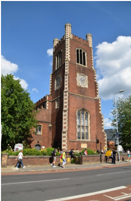
St Paul's Church, Hills Road