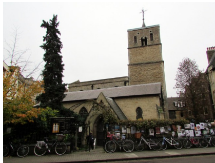
St Bene't's Church, Bene't Street