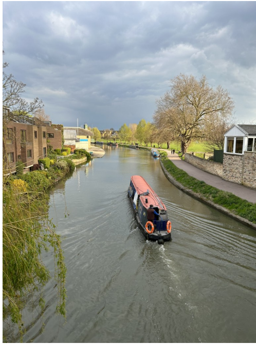
The Cam, from the Fort St George Bridge