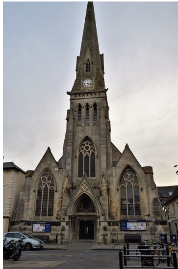
St Ives URC